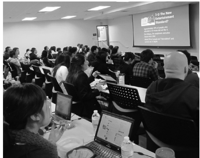
Students at Western University learning about the 3D's of 3D!